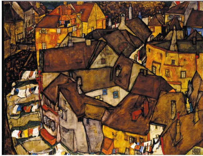
Krumau Town Crescent I (1915) The Israel Museum