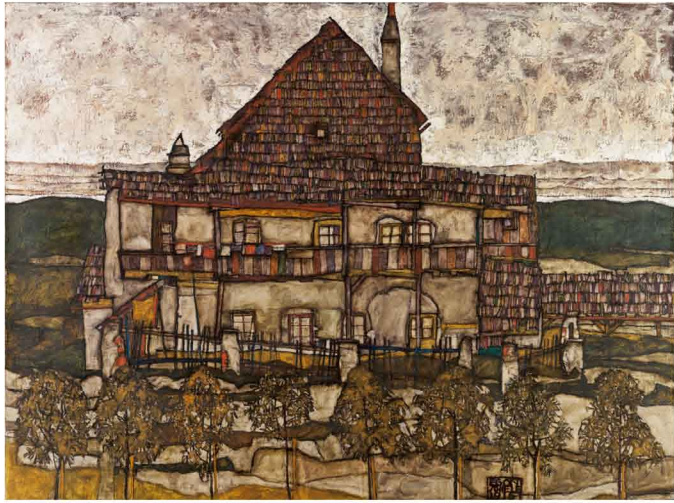
House with Shingle Roof (Old House II) (1915)