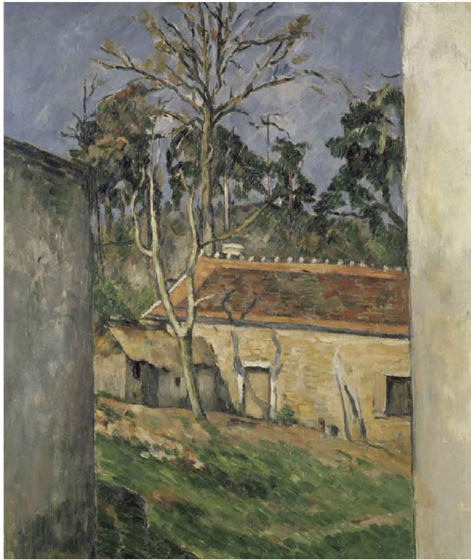
Farmyard (1879) Musée d'Orsay